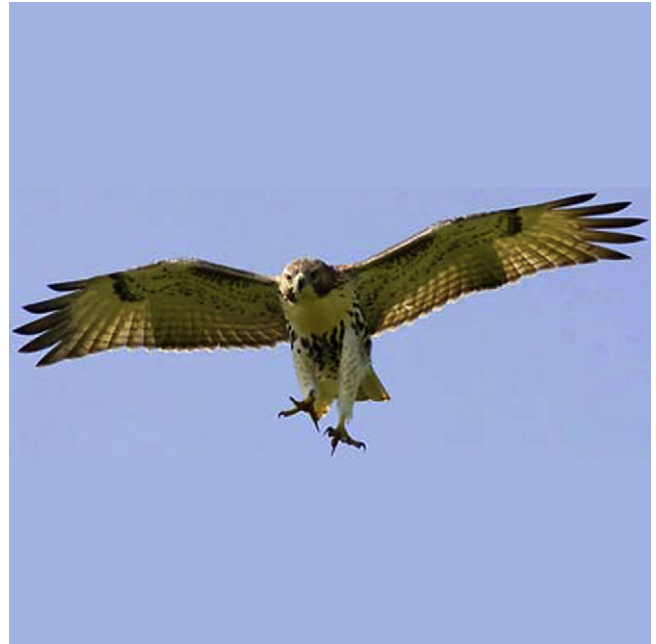
Figure 1. Photograph of the silent visual predator presented to Caribbean hermit crabs on our LCD monitor.

For each experiment, we used paired two-tailed t tests to compare the latency to hide between each treatment. We also