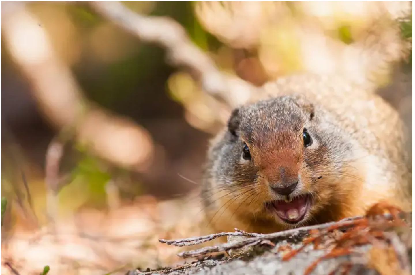
The yellow-bellied marmot ( Marmota flaviventris)