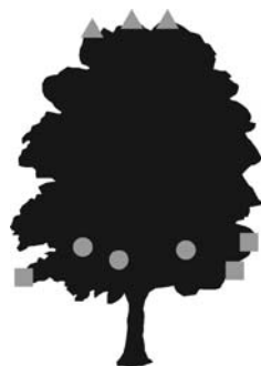
Fig. 1. Schematic of canopy locations sampled with an aerial lift. Three shoots each were sampled from the basal-interior (circles), from the basal-exterior (squares), and from the canopy top (triangles).

general; in studies on trees up to 40 m tall, researchers have suggested that the gradient in the water supply to transpiring leaves from the base to top of the canopy can be partially mitigated by declines in leaf to sapwood area ratio with increasing height and by the hierarchical distribution of stem hydraulic resistances across branching orders (McDowell et al., 2002; Tyree and Zimmermann, 2002). In some cases water is in fact supplied to the upper, exposed leaves with higher conductance per leaf area than to the shaded, lower leaves (Cochard et al., 1999; Sellin and Kupper, 2004, 2005). A crucial question is whether intracanopy leaf plasticity is principally driven by height or exposure. In the first case, the variation would arise due to physical constraints, whereas in the second case it may indicate optimization during leaf development.